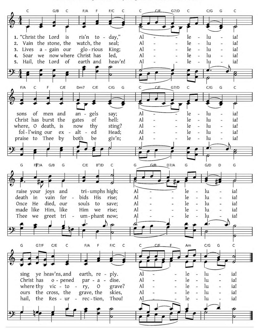
Thanks be to God! He gives us the victory through our Lord Jesus Christ. 1 Cor. 15:57